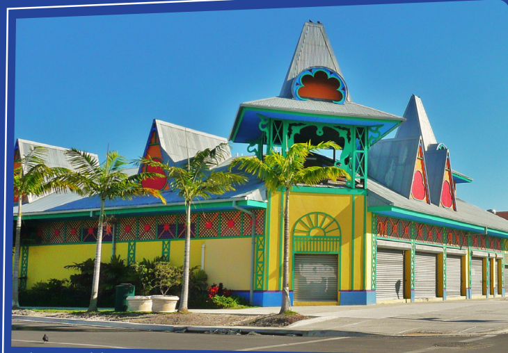
Little Haiti Cultural Center and Market Place